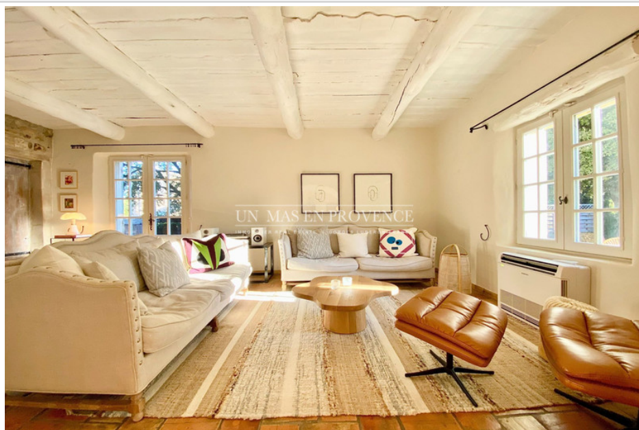
Mansion Ref. : V2600M Maubec

Document non contractuel 08/05/2024 - Prix T.T.C